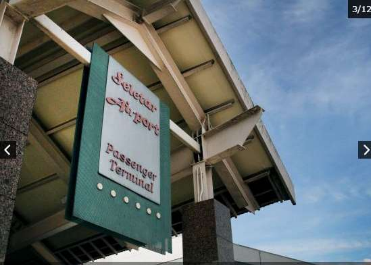
The entrance to Seletar Airport's passenger terminal.