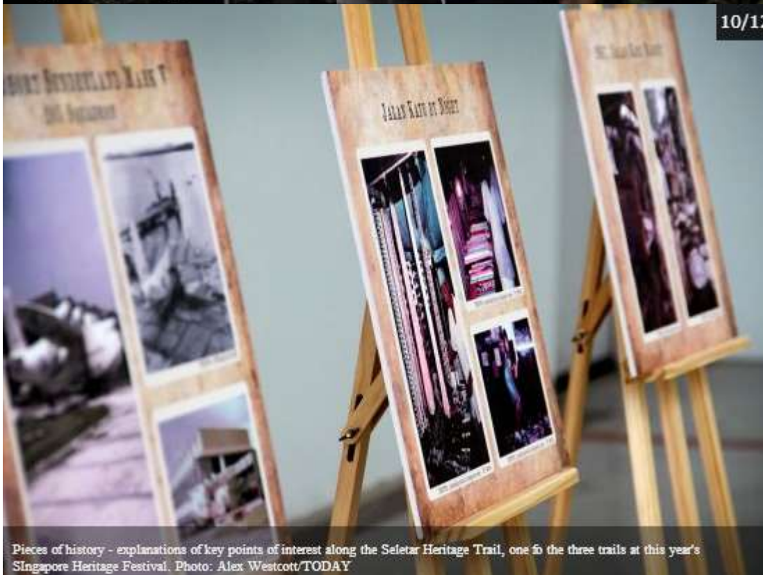
Pieces of history - explanations of key points of interest along the Seletar Heritage Trail, one for the three trails at this year's Singapore Heritage Festival.