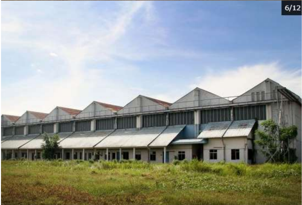
Visitors can appreciate the historic buildings of the Seletar air base along the Seletar Heritage Trail, part of the Singapore Heritage Festival 2013.