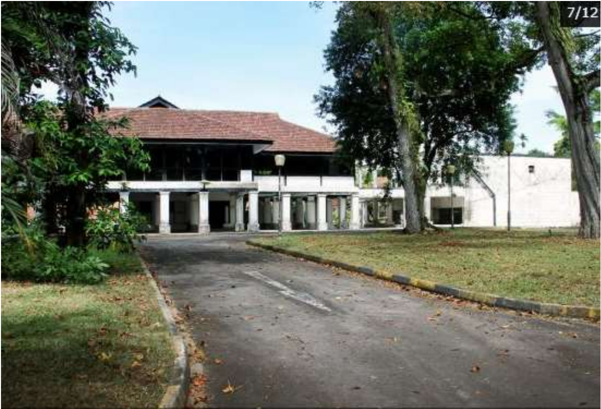
The British officers' clubhouse in one of the many black and white buildings still standing on the Seletar air base. Visitors can explore this traditional architecture on the Seletar Heritage Trail.