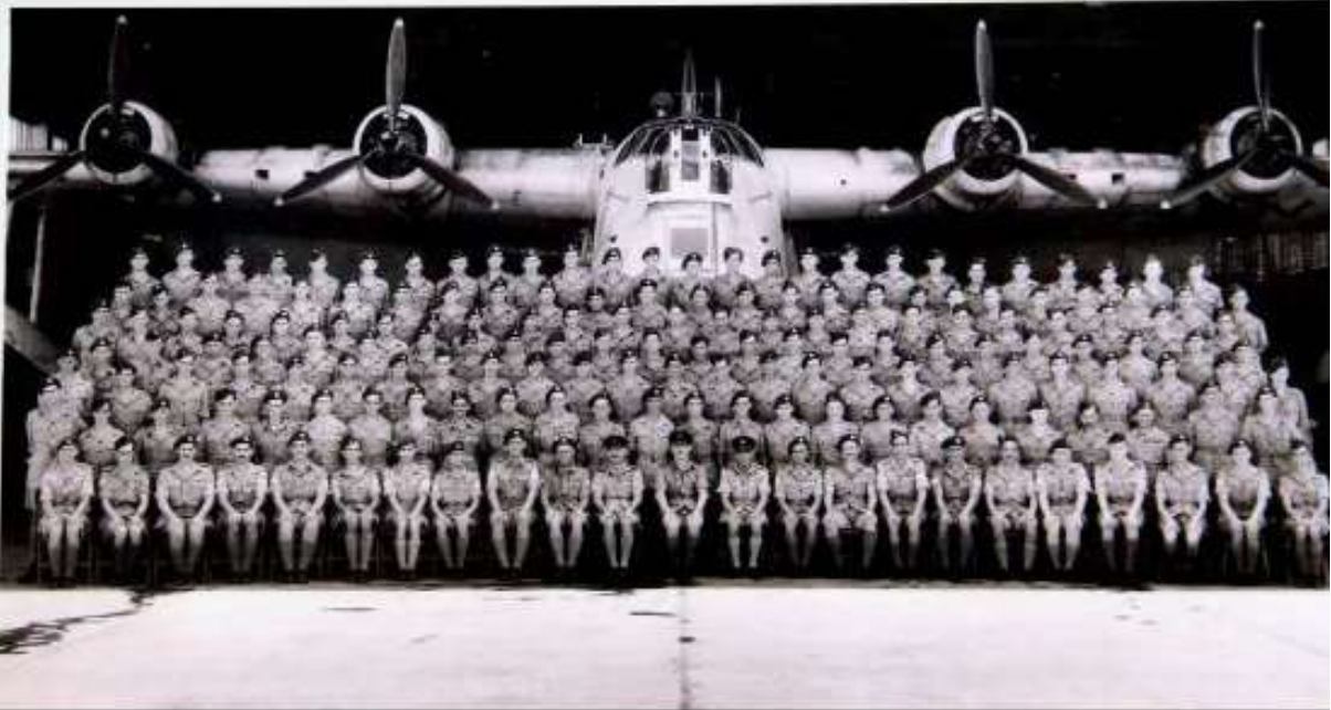
PHOTO http://www.airfieldinformationexchange.org/community/showthread.php Pieces of history of the Seletar air base displayed along the Seletar Heritage Trail, part of this year's ISingapore Heritage Festival running from 19 -28 July.