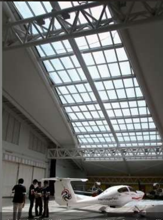
A spectacular incentive to get involved in the festival's photography contest is that five winners will take to the air for a 45-minute flight in one of Wing over Asia's planes for a bird's eye view of Seletar. Participants are encouraged to submit images that capture this year's theme, and post them on the festival website.