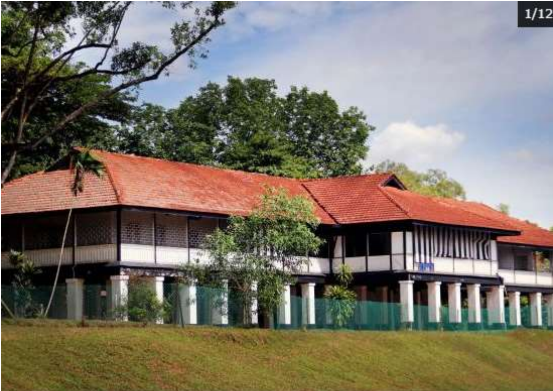
Traditional black and white houses along the Seletar Heritage Trail.