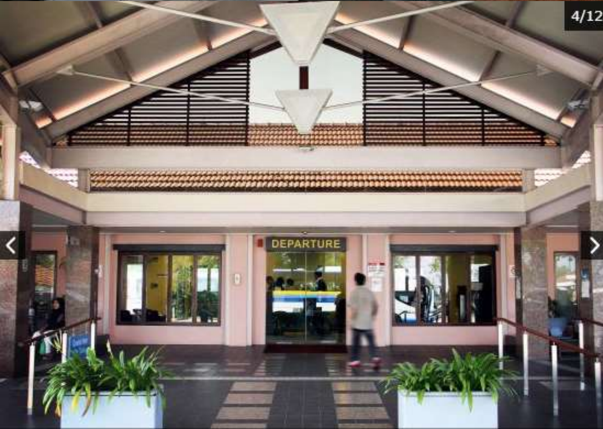
The entrance to Seletar Airport's passenger terminal.